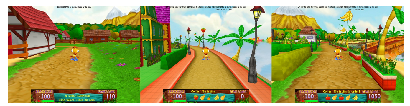
Fig 2. Cogoland game interface. There are three difficulty levels in Cogoland. The main goal of the basic level (left) is to drive the avatar around the island to complete as many laps as possible in ten minutes. The intermediate level (middle), participants are to drive the avatar around the island and collect fruits item presented at the bottom of the screen. At the advanced level (right), participants are to collect the fruits in order as presented on screen. Participants will use a specific key on the keyboard provided to make the avatar jump to collect the fruits. During each training session, participants will complete two 10-minute games, and a short break will be provided between the games.

The following questionnaires were chosen to assess the treatment outcomes at various time-points. With reference to the Gantt schedule (S1 Fig), the 'intensive phase' refers to the 8 weeks of intervention for both groups, 'maintenance phase' is represented by the subsequent